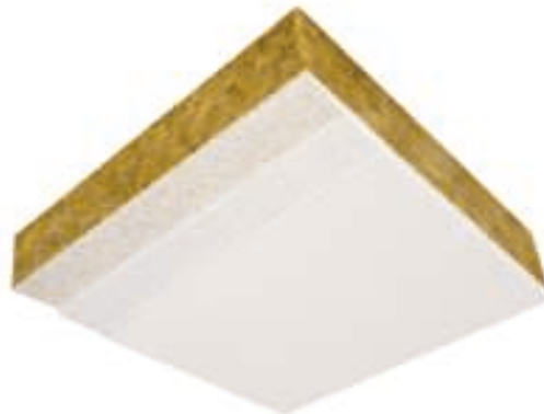
Figure 1: System Structure of CapaCoustic Fine